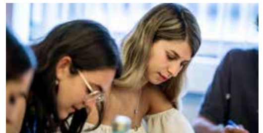
Join us at Chichester College

Chichester English Language School has a track record in delivering high-quality 'English as a Foreign Language' (EFL) teaching and global recognised qualifications. We take great pride in offering a safe and supportive place to learn and grow. Our language school has been accredited by the British Council for the teaching of English in the UK.