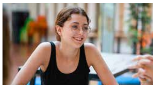
Embrace the taste of independence