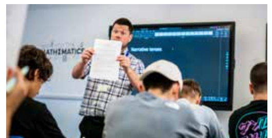
Improve your English skills