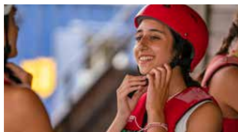
Take part in our activity programme