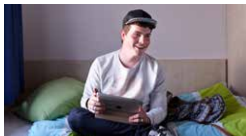
Westgate On-site accommodation