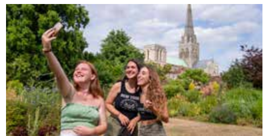
Students posing by the Chichester Cathedral